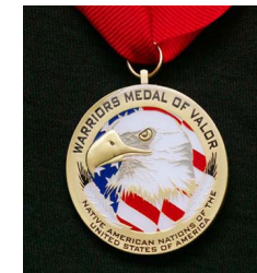
Warrior's Medal of Valor

The Warrior's Medal of Valor is the first medal ever minted for the Native Americans Nations to honor all military personnel, active duty, reservist, National Guard and Veterans.